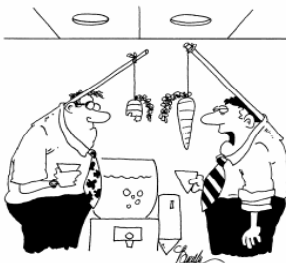
"The new diet not working out too good, huh, Frank?"